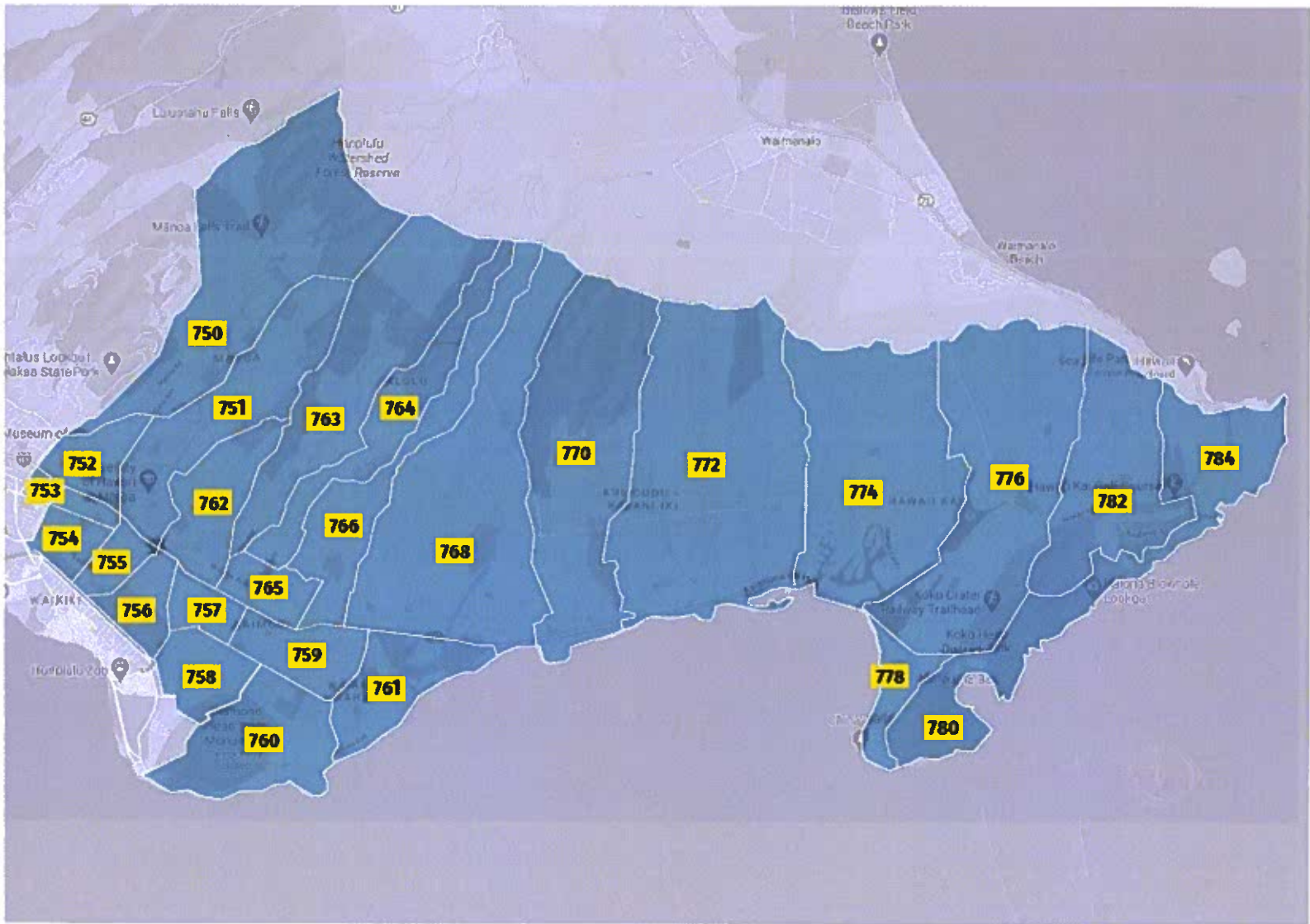
MAP DATA: Google Maps